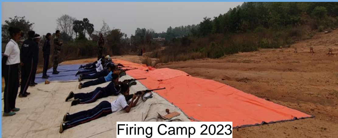
Firing Camp 2023