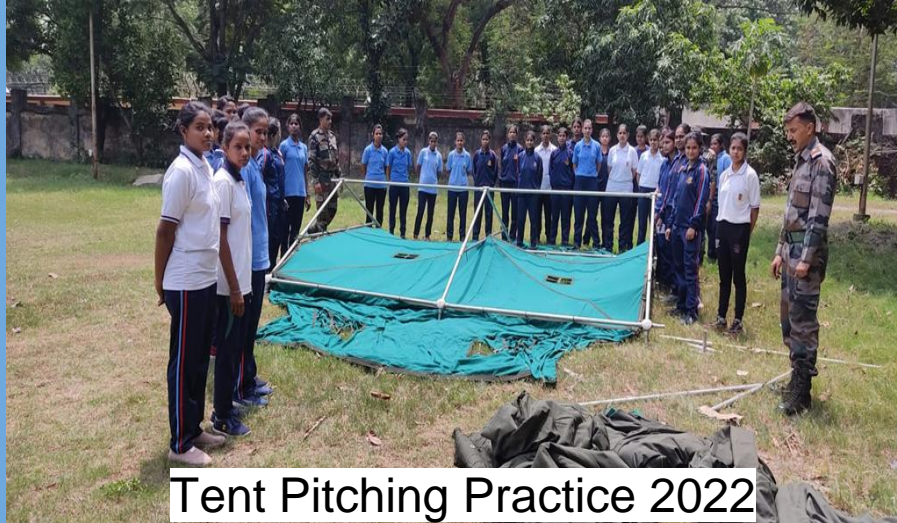
Tent Pitching Practice 2022