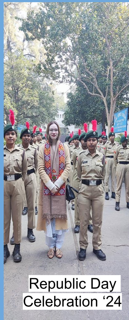
Republic Day Celebration '24