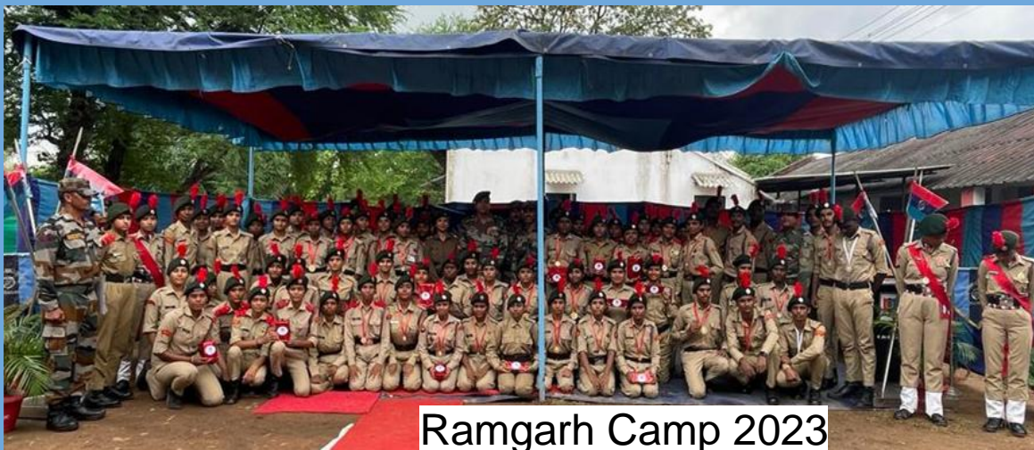
Ramgarh Camp 2023