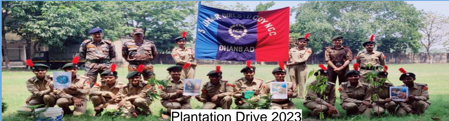
Plantation Drive 2023