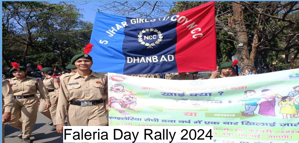
Falaria Day Rally 2024