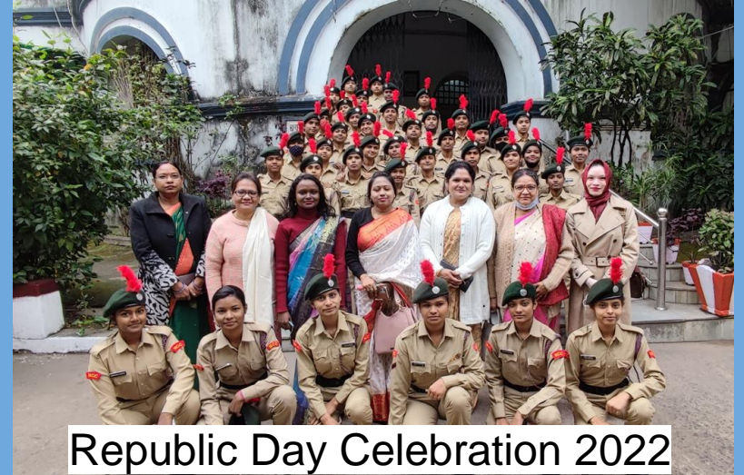
Republic Day Celebration 2022