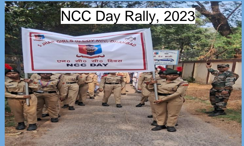
NCC Day Rally, 2023