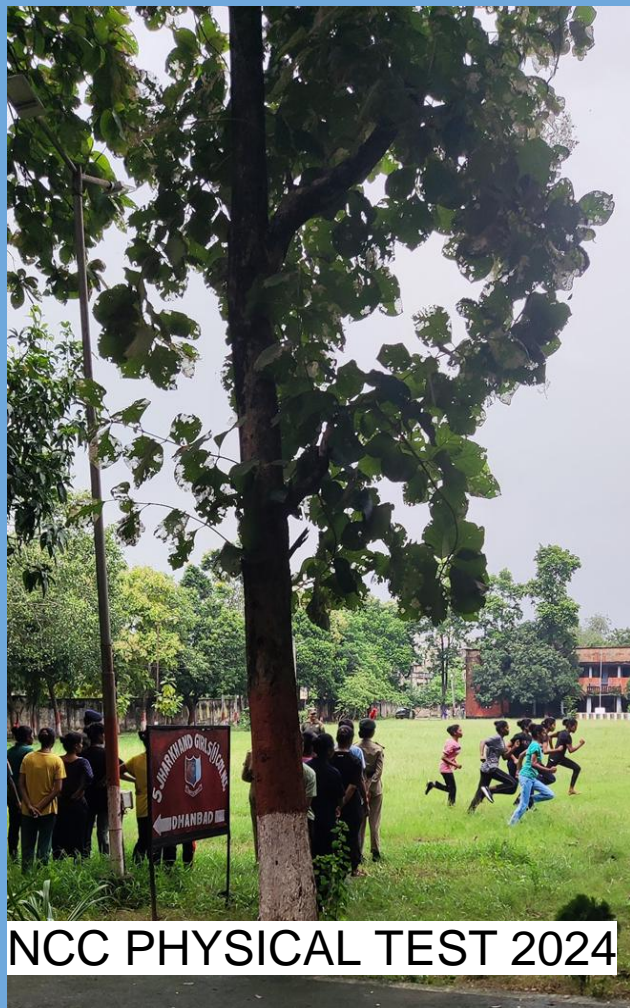
NCC PHYSICAL TEST 2024