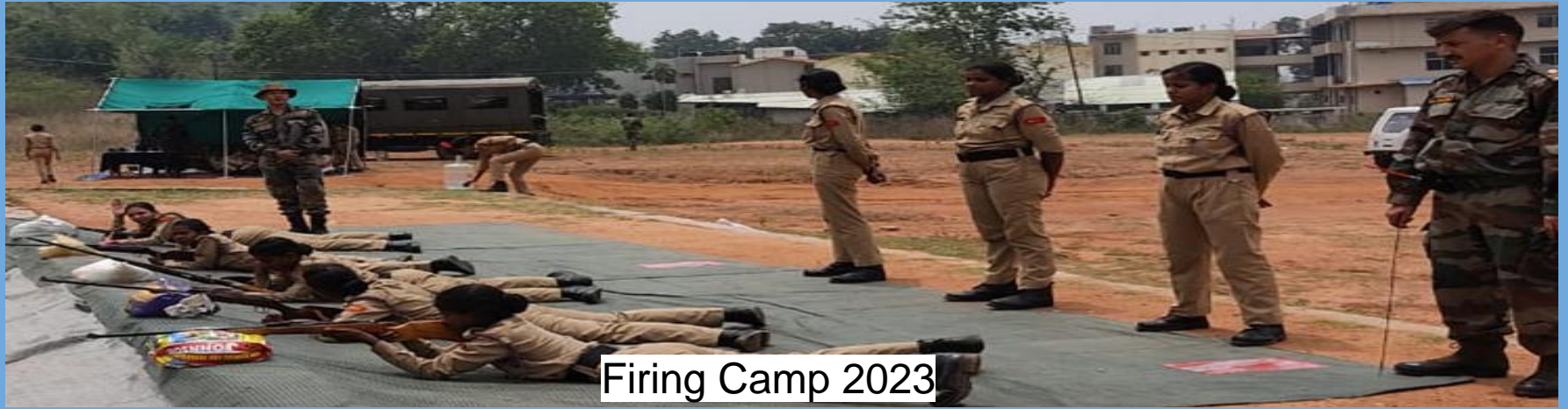
Firing Camp 2023