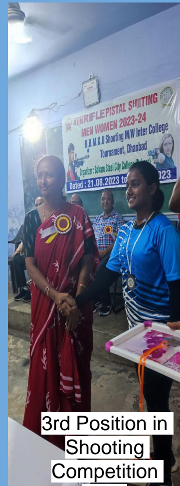
3rd Position in Shooting Competition 2023