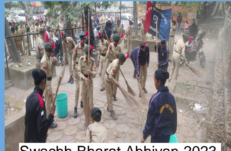
Swachh Bharat Abhiyan 2023