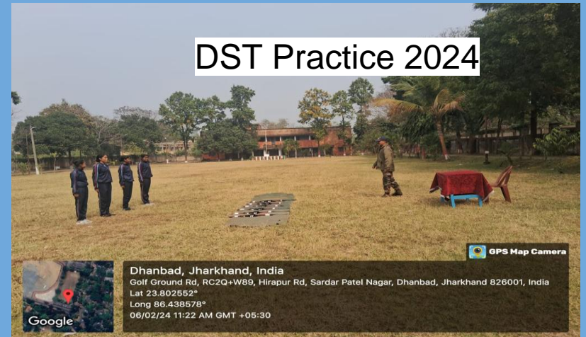
DST Practice 2024