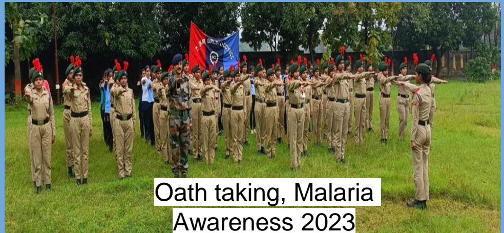
Oath taking, Malaria Awareness 2023