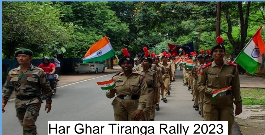
Har Ghar Tiranga Rally 2023