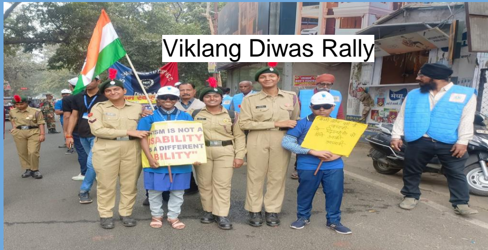
Viklang Diwas Rally