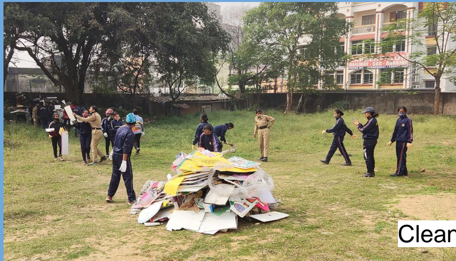
Clean Campus Drive