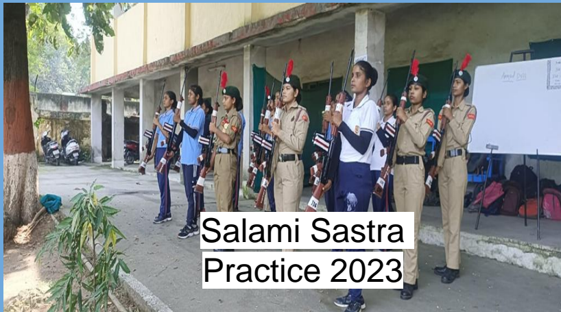
Salami Sastra Practice 2023