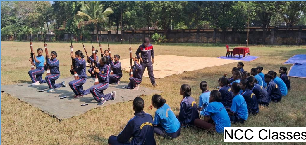
NCC Classes 2023