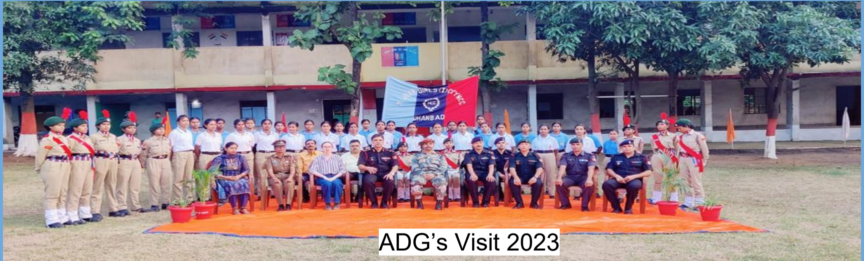
ADG's Visit 2023