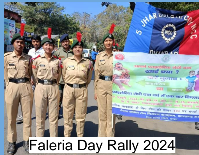
Falaria Day Rally 2024