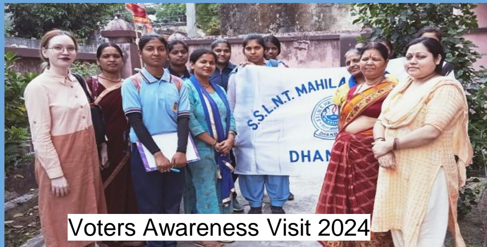
Voters Awareness Visit 2024