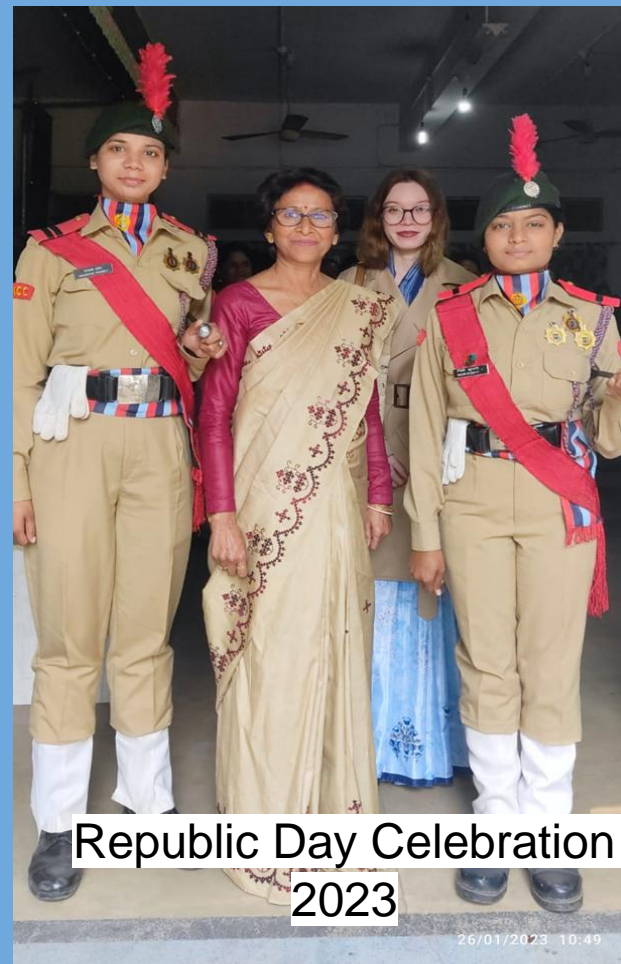
Republic Day Celebration 2023