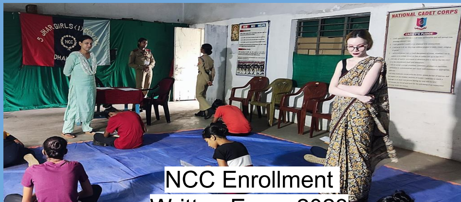
NCC Enrollment Written Exam 2023