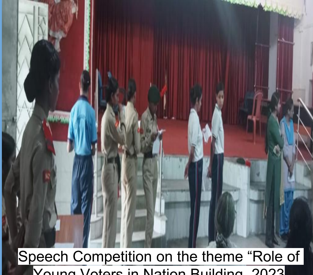
Speech Competition on the theme "Role of Young Voters in Nation Building. 2023"