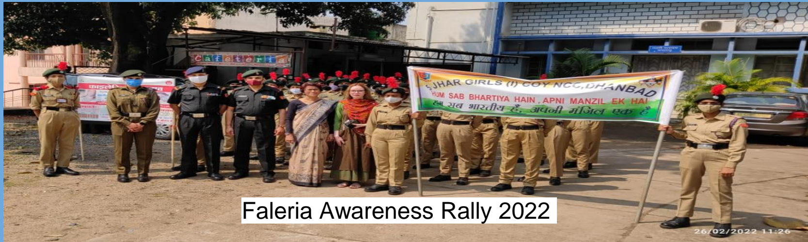
Faleria Awareness Rally 2022