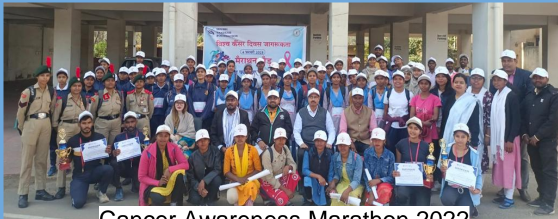
Cancer Awareness Marathon 2022